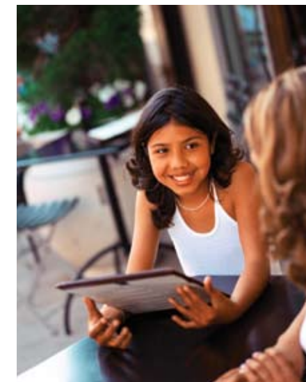
Lunching at Bay and Secord, then strolling down to the Waterfront.