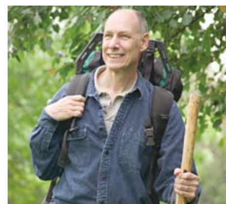
Hiking from Chippewa to the Current River to Chapples on a trail that links to all of Canada (Trans Canada Trail).