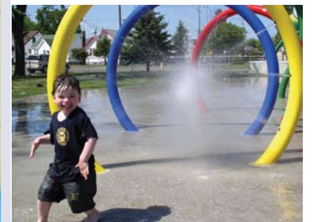
Taking your child to the splash pad at the water's edge.

Imagine sights, sounds and lots of activities that, each day, celebrate the life and history of our community.