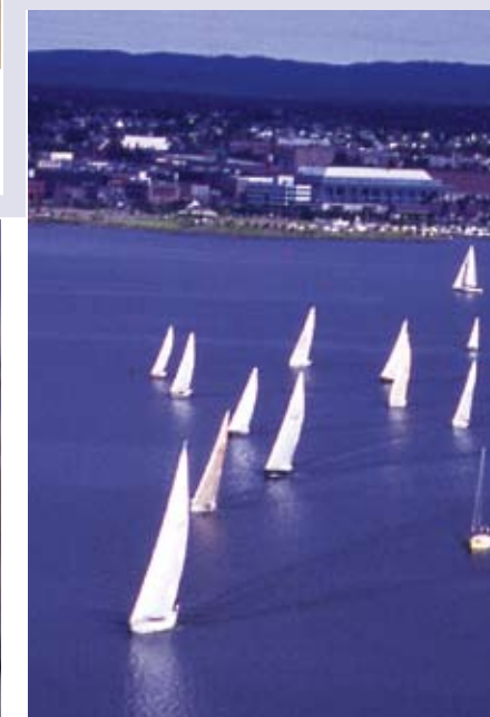
Enjoying new festivals that celebrate the water: kayaking? sailing? fishing? ice climbing? recreational activities of all kinds!