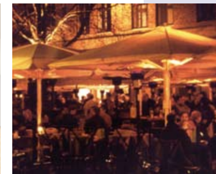
Relaxing with a cup of coffee or a cold drink and enjoying a great view.