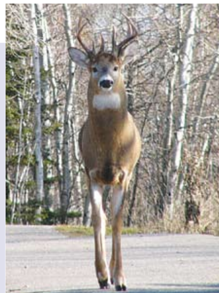
Taking a water taxi to the Islands for a walking tour to see the deer.

Imagine our Waterfront connected by trails, water trails and themed signage that tells our story.