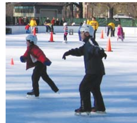
Skating, then warming up with a hot chocolate by the fire pit.