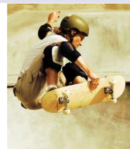
Skateboarding or the thrill of spectating.