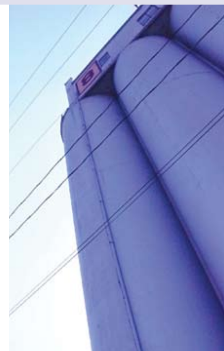
Celebrating the contribution of our elevators to Thunder Bay's growth and the success of the Seaway.