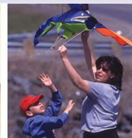
Enjoying all kinds of adventures whether you are an outdoor – or armchair – enthusiast.