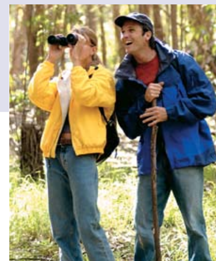
Exploring our wetlands and meeting birders from around the world at Mission Marsh.