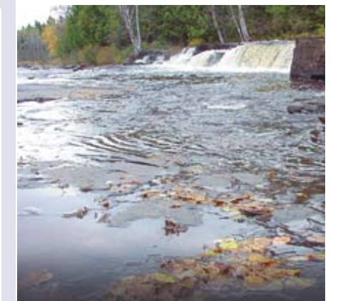
Sharing a picnic at the mouth of the Current River.