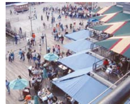
Shopping on Red River Road right through to the Public Pier at Prince Arthur's Landing.