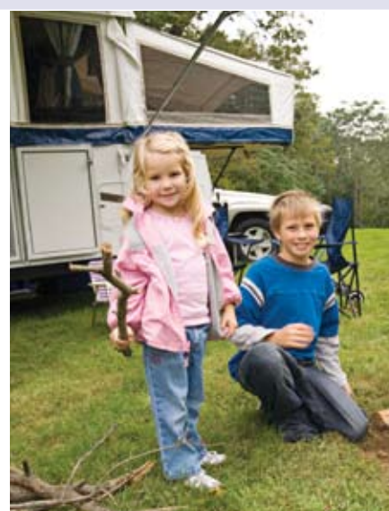
RVing and making the Waterfront your vacation destination.