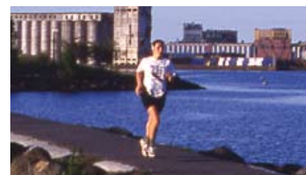
Walking or jogging the Waterfront trail.