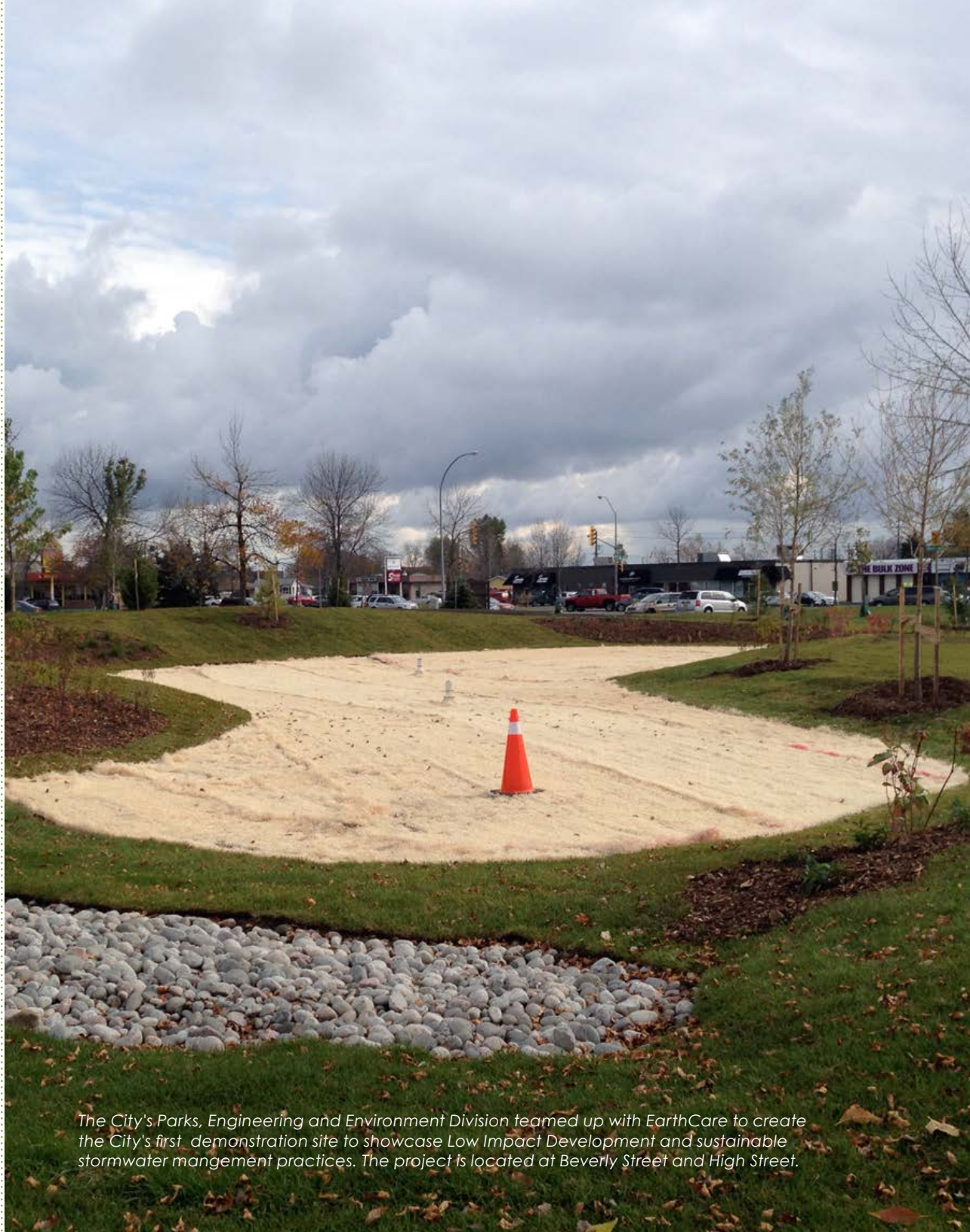
The City's Parks, Engineering and Environment Division teamed up with EarthCare to create the City's first demonstration site to showcase Low Impact Development and sustainable stormwater management practices. The project is located at Beverly Street and High Street.