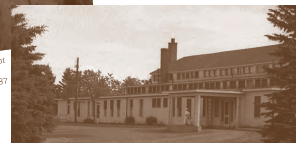
Ontario Hospital Fort William, 1937