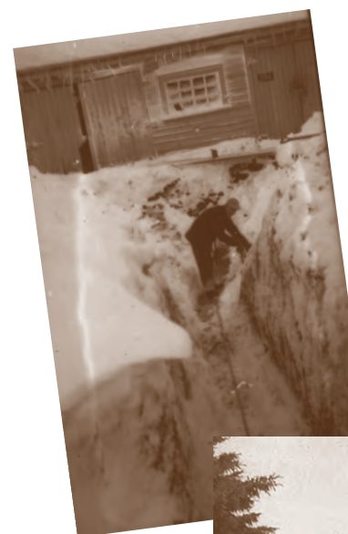
Water problems at Ontario Hospital Fort William, 1937

south, "where, I presume, overcrowding is not noticed so severely." 13