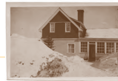
Staff residence at Neebing site, late 1940's

The situation of the patients themselves was not greatly improved, however. Treatments had not changed significantly from the pre-war era, and would not change until the development of a new regimen of drugs, and their introduction, in the 1950s. Electro-shock continued to be the standard therapy for the most disturbed patients, and it was used extensively across the whole Ontario Hospital system. Dr Cleland would make rounds to the medical hospitals at the Lakehead three times a week, carrying a portable ECT machine with him. Most of those admitted to the hospital were diagnosed as suffering from schizophrenia, “mania” or depression. According to Dr. Morley Smith, Medical Director of the Lakehead Psychiatric Hospital in 1979, in these early days “personality disorders were not prominent in the diagnostic groups admitted.” But, he added, fatalities occurred sometimes “simply because patients exhausted themselves without effective treatment.” Nick Ochanek, who became an attendant at Fort William in 1946, recalls that patients were overseen in three shifts through the day with three or four attendants on each shift. They were responsible for housekeeping, bed-