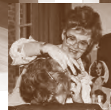
Hair salon, early 1970's