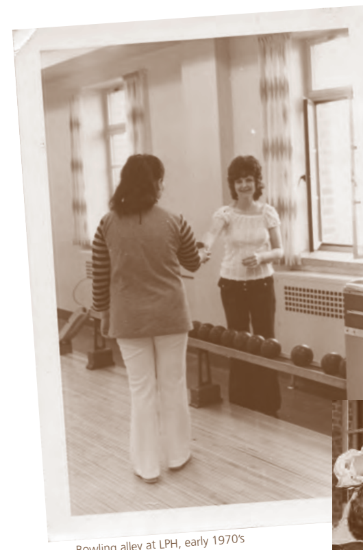
Bowling alley at LPH, early 1970's