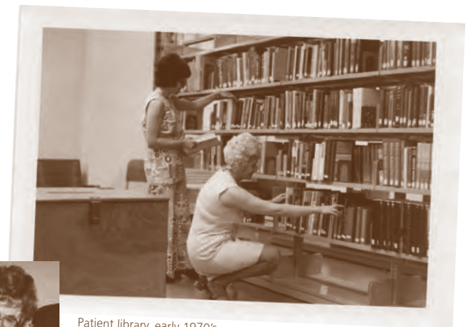
Patient library, early 1970's