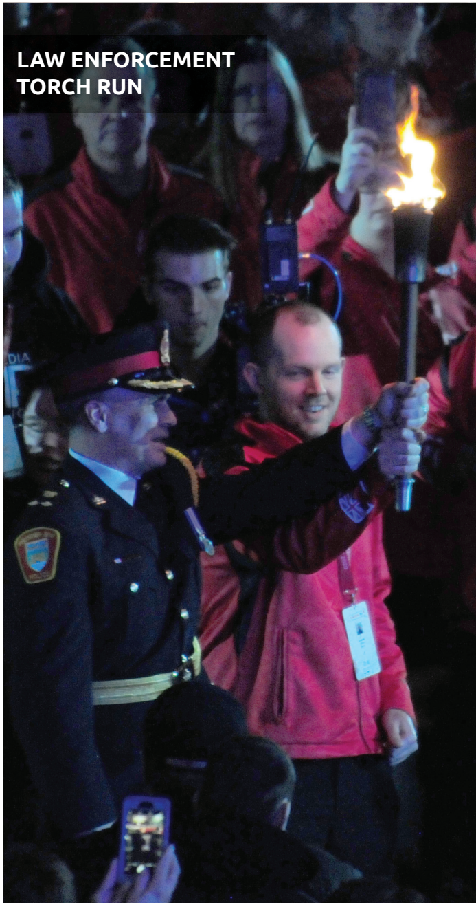
LAW ENFORCEMENT TORCH RUN