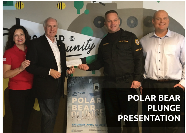
POLAR BEAR PLUNGE PRESENTATION