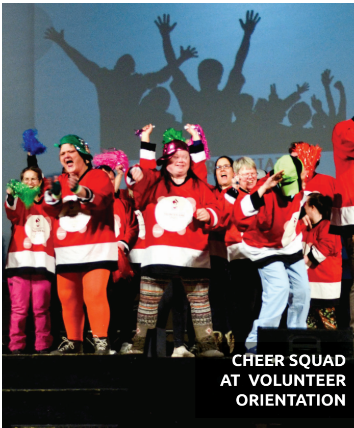
CHEER SQUAD AT VOLUNTEER ORIENTATION

support — City Council, the City employees, our Thunder Bay Police Services, Fire Services, City Transit, Tbaytel and all City departments at virtually all levels, who not only volunteered on various committees, but as important, assisted, supported and helped out with their “on the job work” to ensure a safe and well organized environment for the athletes and all involved in the Games. The GOC team are so proud of everyone and so very grateful. Words cannot express our heartfelt thanks for everything you have done – being grateful just doesn’t seem enough—thank you.