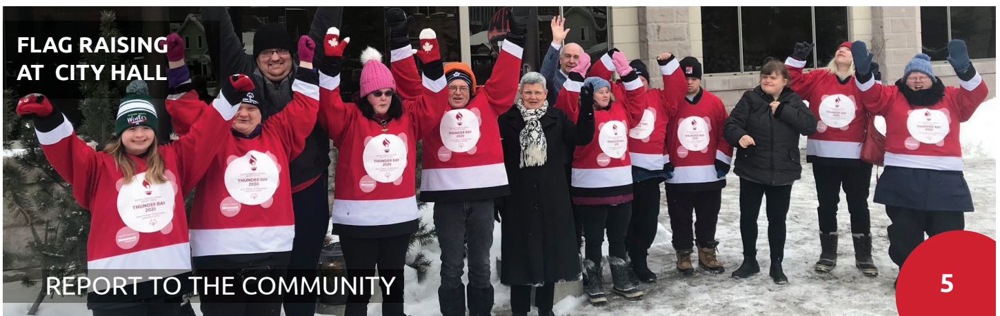
FLAG RAISING AT CITY HALL

The Games also received significant financial support from the City of Thunder Bay as well as services in-kind support from the municipality. This support formed the financial building blocks of the event and provided a base to implement the sponsorship and fundraising campaigns that were so important to ensure the Games succeeded. The City’s commitment spurred others to become involved. In addition, because of the City of Thunder Bay’s significant support we were successful in obtaining through grant applications, commitments from the provincial and federal