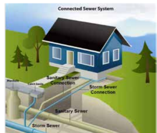
Sewer connection from the home to the sewer main

Sewer and storm connections are the joint responsibility of the City of Thunder Bay and the property owner. The City is responsible for the portion of the connection on City property from the main to the property line. The property owner is responsible for the connection from the property line to the house. According to the Ontario Building Code, sewer and storm connections are required to have a front cleanout. Front cleanouts are generally located in the basement floor within 3 metres of the front wall of the building sealed with a threaded cap. Front cleanouts allow access to the connection for inspection and maintenance while also lowering the risk of equipment getting stuck in the connection.