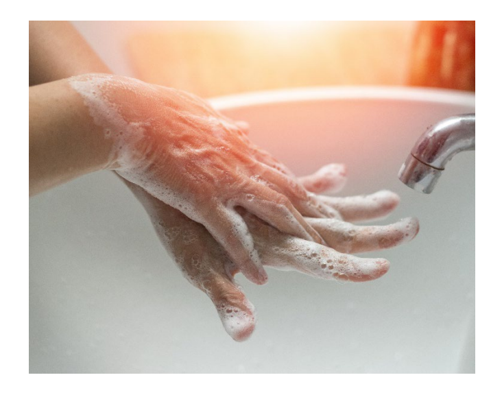
Cleaning Your Hands