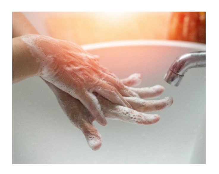
Using soap and running water