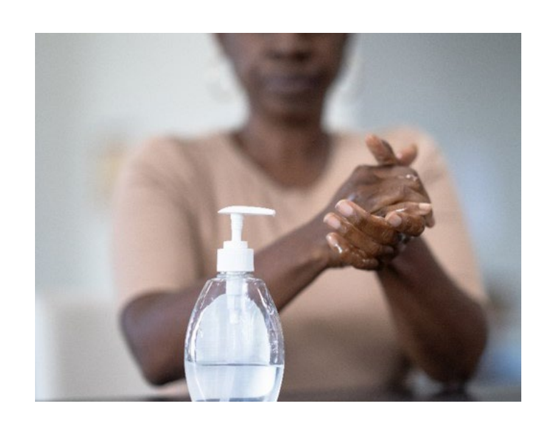
Using Alcohol-Based Hand Rub (ABHR)