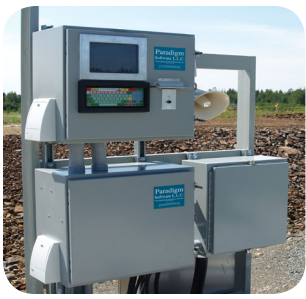
Automated commercial scale