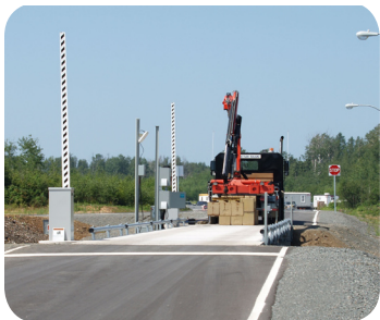
Commercial scale entrance

Getting There: The entrance is now on Mapleward Road between Oliver Road and John Street Road. The old entrance on John Street Road will be closed.