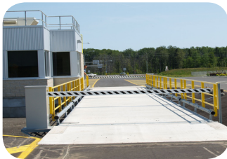
Scale kiosk exit lane