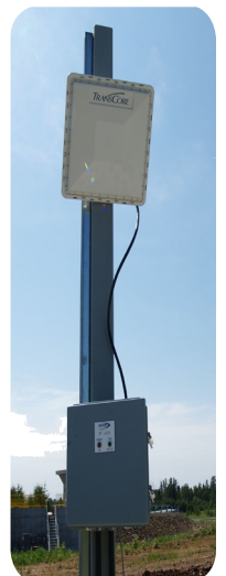
RF barcode reader

you are on the scale, your truck's gross weight will register. All other pertinent information will already have been stored for you.