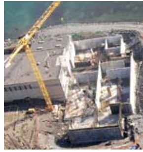
New Reservoirs under construction