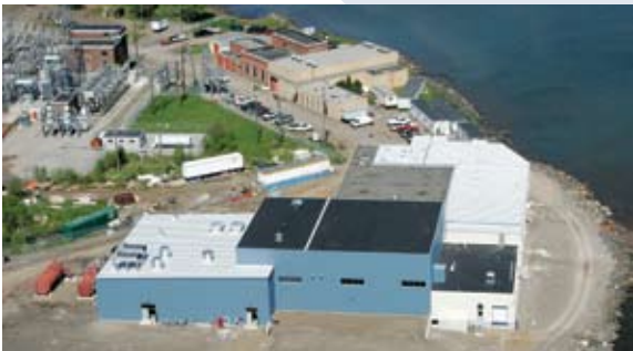
New Plant nearing completion