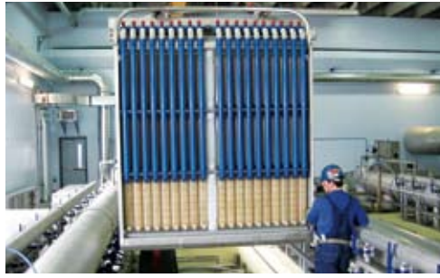
Ultra Filtration Unit – ZeeWeed 1000 Version 3