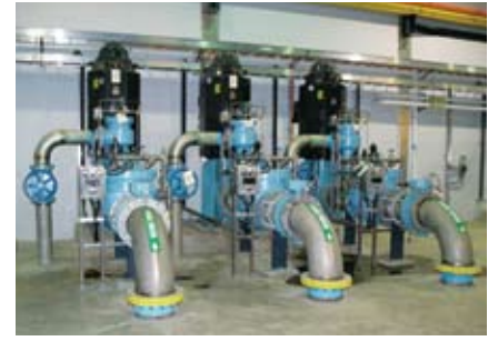
New Verticle Turbine High Lift pumps