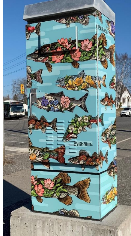
Figure 2. Mini City by Jordan Danielsson